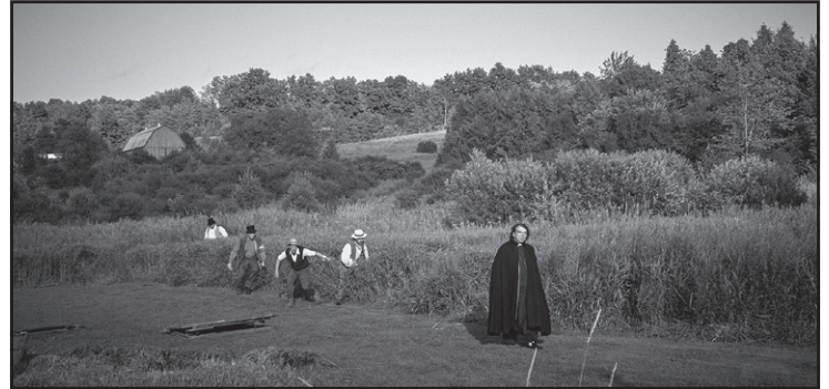
The Cavan Blazers, 2023.