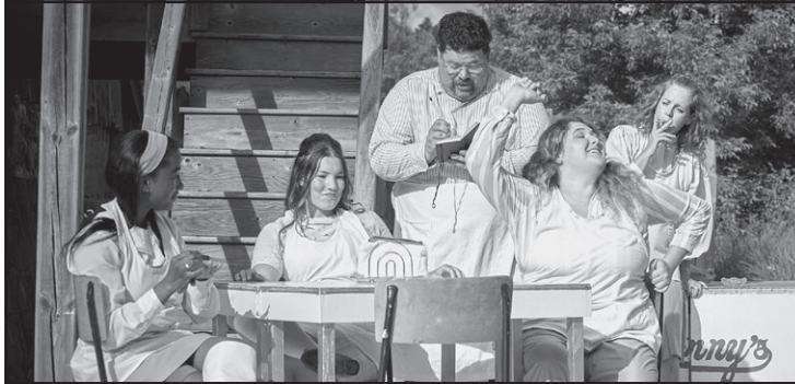
The Tilco Strike , 2023.