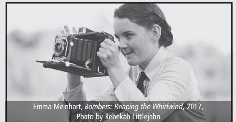
Emma Meinhart, Bombers: Reaping the Whirlwind , 2017, Photo by Rebekah Littlejohn

Call the box office at: 705-932-4445 or 1-800-814-0055 . Or visit us online at: www.4thlinetheatre.on.ca